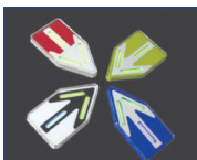
Landmine Route Markers