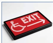
Specialty Exit Signs